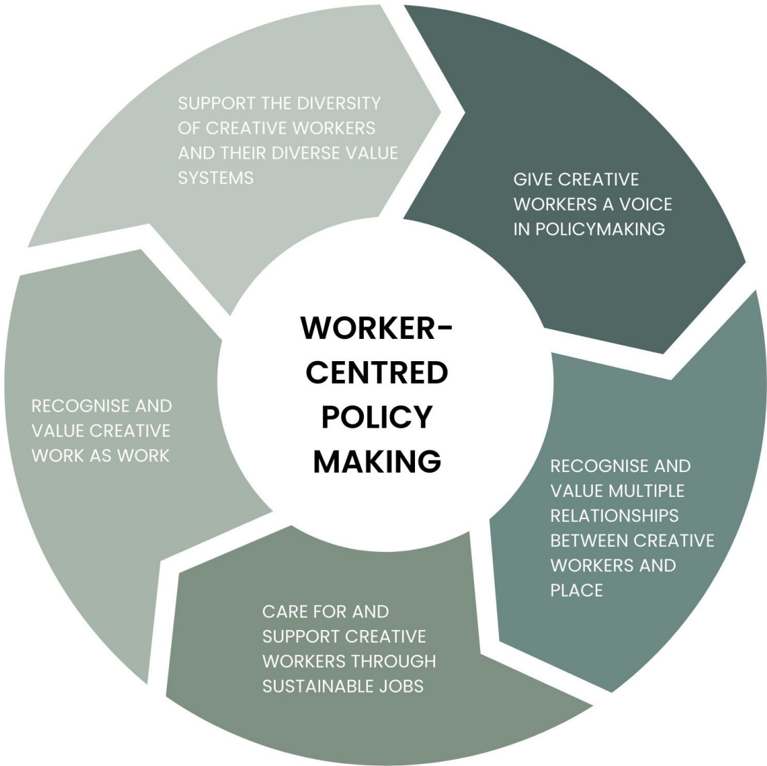
► Key components of creative worker-centred policy-making

acknowledge that there are significant challenges ahead as the conditions of the pandemic extend and evolve. It is for both academic and policy-makers to address those challenges together, learning from international examples of good practice, making sure that research can add value to policy, and that policy can test and develop academic ideas for the benefit of the citizens, cities and regions at the heart of their work.